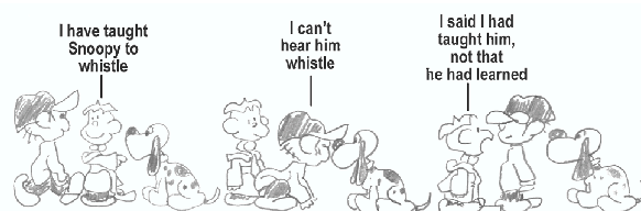
Fig. 2: I said that I taught him not that he had learned

Starting with problems can be very motivating for students who may not see why they should be interested in inputs of bodies of knowledge but may become very engaged in researching these bodies of knowledge to address the learning issue they have identified themselves from working on the problem. Problem-based learning forces students to name what they need to learn to work on the problem. Some forms of lecturing in contrast have been referred to as the process of answering questions students never asked in the first place.