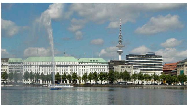
Hamburg, City Centre.

The programme is completely taught in English. It provides sound training in best practice methods of mainstream economics. Opportunities for optional in-depth studies in areas of personal interest initiate a gradual transition to independent research. The programme is designed for careers in higher education, research or consultancy on both the national and international level.