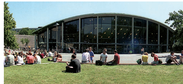
University of Hamburg, Auditorium Maximumum

University of Hamburg School of Business, Economics and Social Sciences Department of Economics Von-Melle-Park 5, Entrance C D-20146 Hamburg