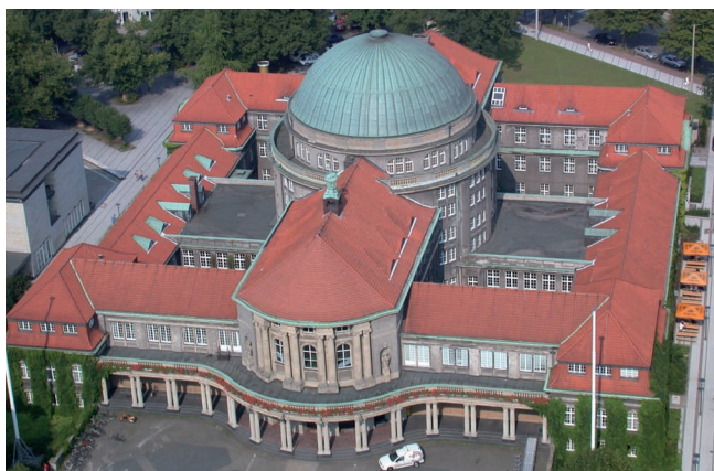
University of Hamburg, Main Building

Today's economists face globally competitive and increasingly complex environments. The University of Hamburg's "Master of Science in Economics" (M.Sc.) programme responds effectively to these developments. It provides thorough and rigorous training in modern economic theories and techniques. It attaches great importance to quantitative skills and emphasizes state-of-the-art methods of empirical research. It encourages applied work and relates it to policy. The acquired tools and research skills prepare students for real-world economic situations and challenges.